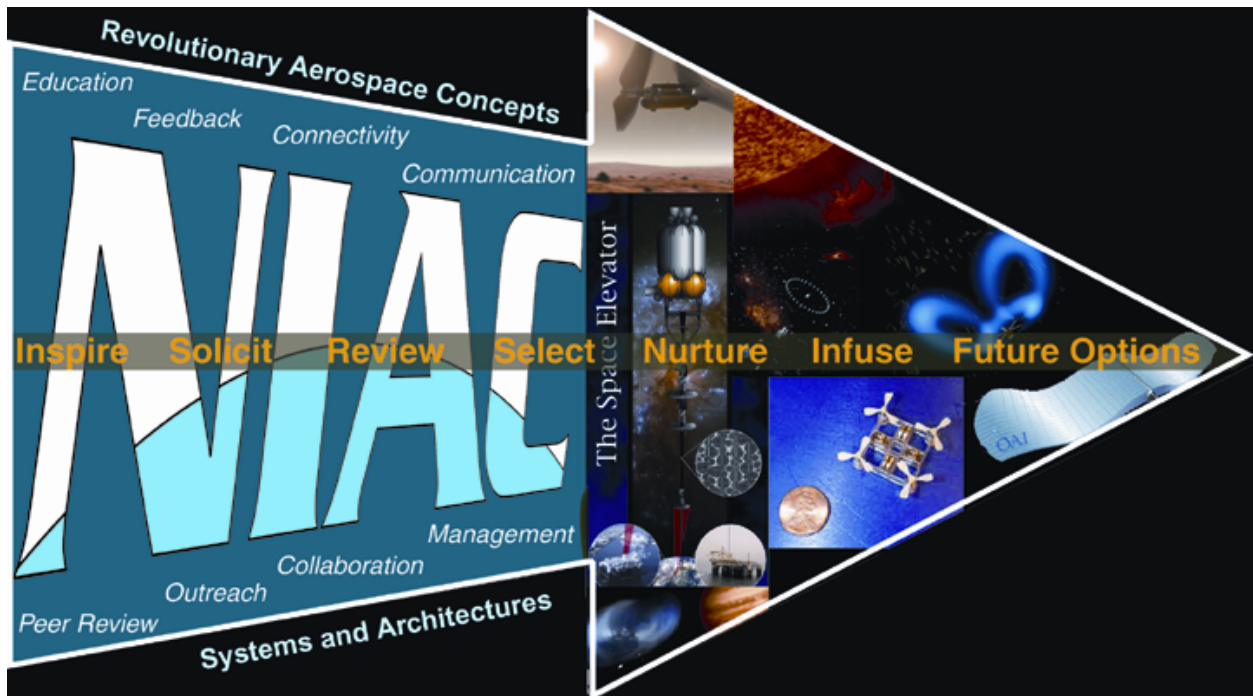
Figure 1: How NIAC Operates

NIAC’s role is to provide additional options for consideration by NASA with the potential for revolutionary improvement in aerospace performance and the resulting dramatic extension of missions and programmatic goals. NIAC provides a pathway for innovators with the ability for non-linear creativity to explore revolutionary solutions to the Grand Challenges of future aerospace endeavors. The ultimate goal of the NIAC process is to infuse the most successful advanced concepts into mainstream NASA plans and programs.