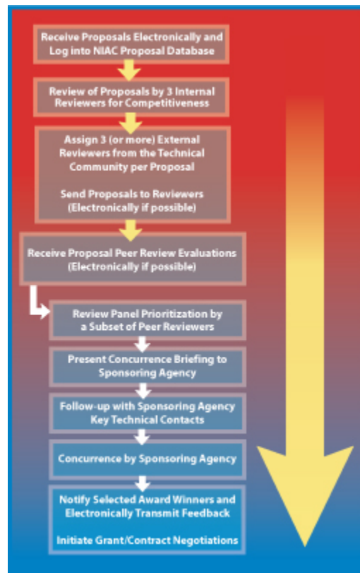
Figure 4. The NIAC Proposal Review Process

Figure 4 describes the sequence of events for receipt, review, and selection of advanced concepts for an award. Following electronic logging of a proposal in the NIAC database, the NIAC review process commences with a "Review of Proposals by 3 Internal Reviewers for Competitiveness". Proposals that do not meet the selection criteria described on page 17 of this CP will not be passed to the next level of review. Competitive proposals are subject to scientific review by discipline specialists in the area of the proposal as shown in Figure 4.