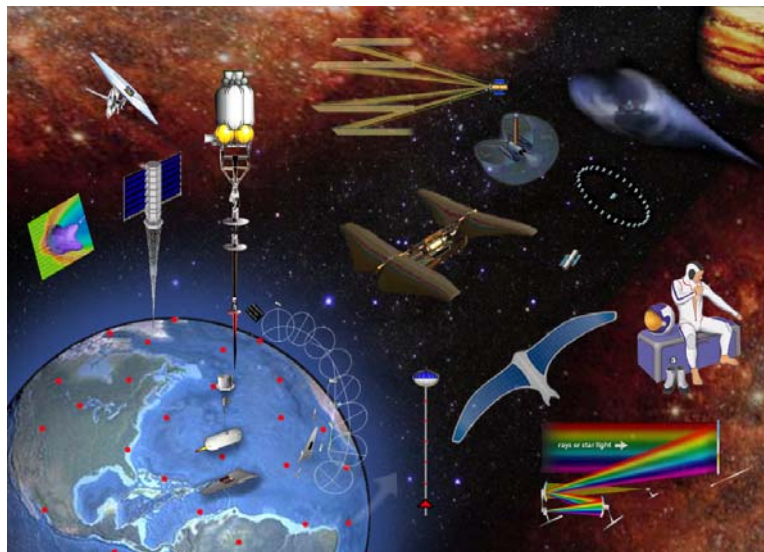
Figure 3. Transition and Infusion of Key NIAC Concepts into Long Range Plans

After a concept has been developed and nurtured through the NIAC process, it is NASA's intent that the most promising concepts will be transitioned into its program for additional study and follow-on funding. NIAC works closely with NIAC Fellows and NASA representatives to explore the technical and programmatic potential for NIAC advanced concepts to be infused into NASA's long range plans. Figure 3 illustrates a few of the advanced concepts that have successfully transitioned into NASA's long range plans.