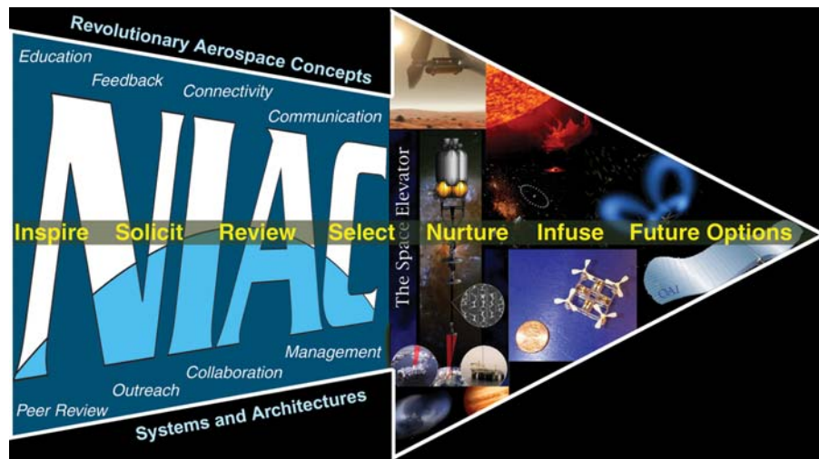
Figure 1: NIAC's Process for Identification and Nurturing of Advanced Concepts

Figure 2 depicts the relationship between current NASA programs, technology and the NIAC mission for development of advanced concepts and underscores the criterion that NIAC concepts are intended for implementation 10 to 40 years into the future. The general thrust of the NIAC advanced concepts is to develop revolutionary ideas which have a potential for leaping well past the current plans to expand the vision of NASA's long-range strategic plans. Since these concepts may be largely independent of existing technology, these revolutionary architectures and systems may provide the rationale and driving force for the identification and focus of future efforts on critical, enabling technology.