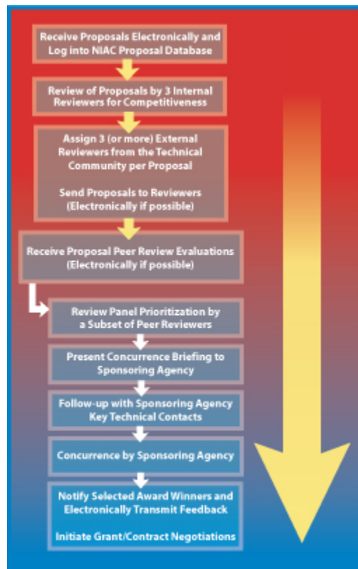
Figure 4. The NIAC Proposal Review Process

Figure 4 describes the sequence of events for receipt, review, and selection of advanced concepts for an award. Following electronic logging of a proposal in the NIAC database, the NIAC review process commences with a "Review of Proposals by 3 Internal Reviewers for Competitiveness". Proposals that do not meet the selection criteria described on page 17 of this CP will not be passed to the next level of review. Competitive proposals are subject to scientific review by discipline specialists in the area of the proposal as shown in Figure 4.