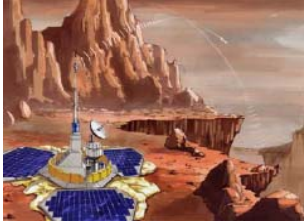
A conceptual illustration of the Meteor Burst Telecommunication Lander Platform on Mars.

The envisioned future may include continuous operating outposts and networks on other worlds supporting human and robotic exploration. Given this possibility, a feasibility analysis is proposed for a communications