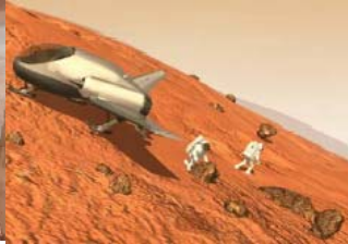
A conceptual rendering of the Meteor Burst Telecommunication Human Platform on Mars.