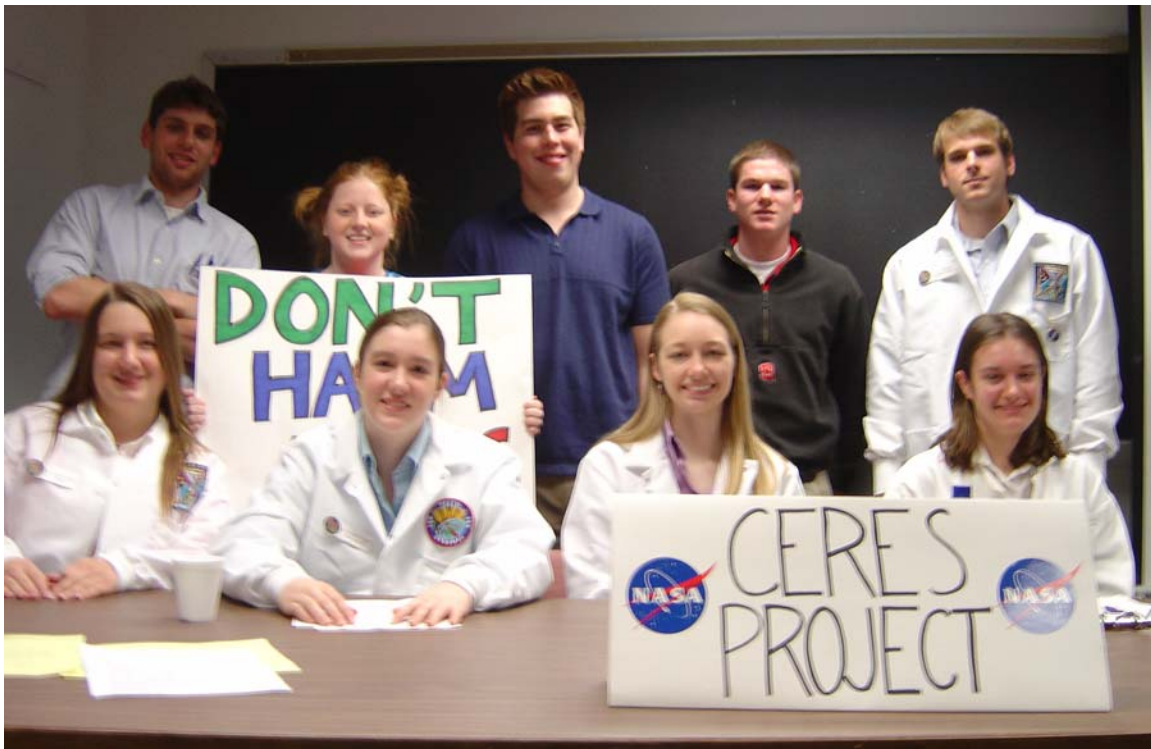
Figure 2. The ALS 398 Honors students sharing their concepts for “Redesigning Plants to Survive on Mars” during their oral presentation on April 26, 2005

figure 2. Their Powerpoint presentation is attached as a separate pdf file). The students described how they would design their greenhouse, and how they would use microorganisms to help amend the soil for increased plant growth as well as to generate electricity to help power the greenhouse. They selected several species of plants they wanted to grow in their ecosystem, and identified several suites of genes to be engineered into these plants, which they proposed would increase tolerance to cold and drought. They also described how they proposed to set up experiments in the greenhouse to test different soils and to have biosensors to monitor when plants were stressed or needed water or oxygen. The students' final deliverable was a paper describing their concepts for redesigning plants both for life support facilities and as a means for terraforming Mars.